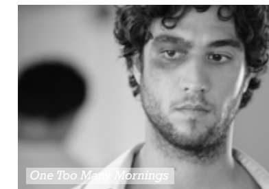
One Too Many Mornings