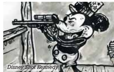
Disney Shot Kennedy