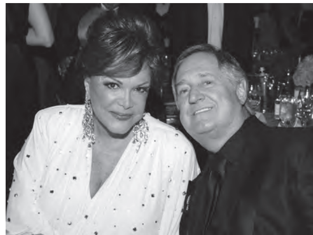
Connie Francis and Friar Neil Sedaka