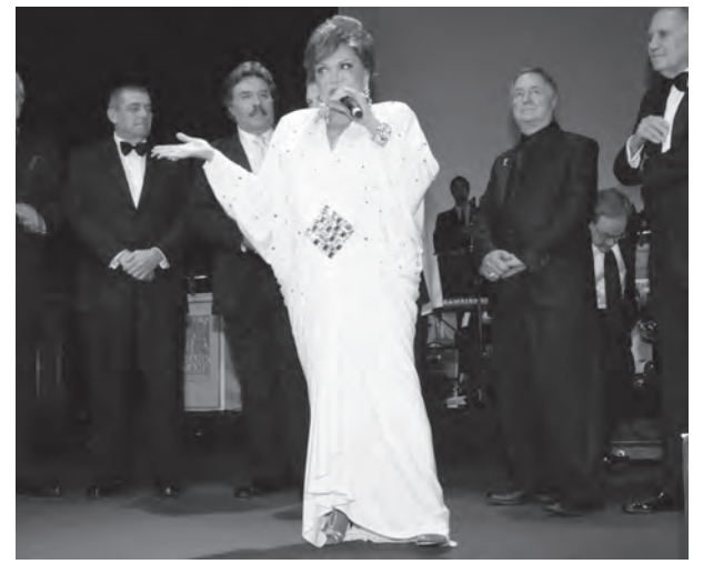
Connie Francis and performers sing God Bless America