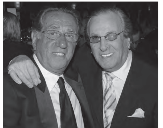
Friars Frank Pellegrino, Danny Aiello