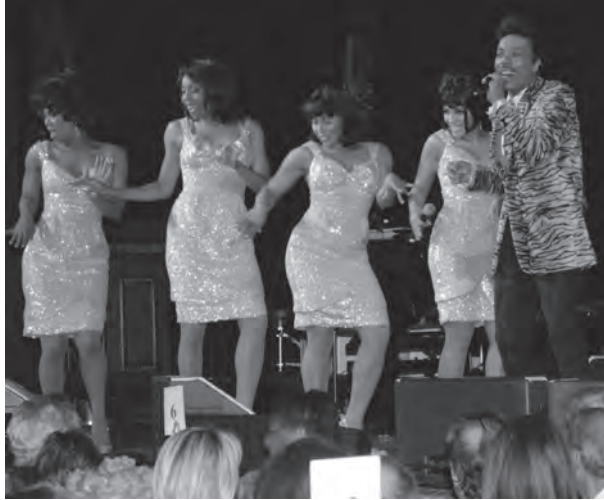
The Cast of Baby It's You