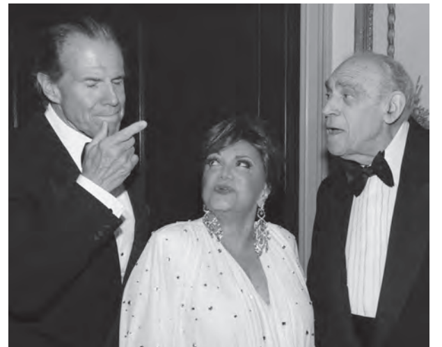
Friar Bill Boggs, Connie Francis, Friar Abe Vigoda