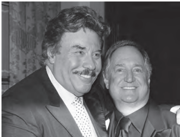
Friars Tony Orlando and Neil Sedaka

Friar Neil Sedaka shares a very special bond with Connie, "My first hit was done by Connie Francis, it was called Stupid Cupid , in 1958." Dedicated to the woman who gave him his start, he took us down Sedaka Lane with Breaking Up Is Hard To Do , The Hungry Years and Laughter In The Rain .