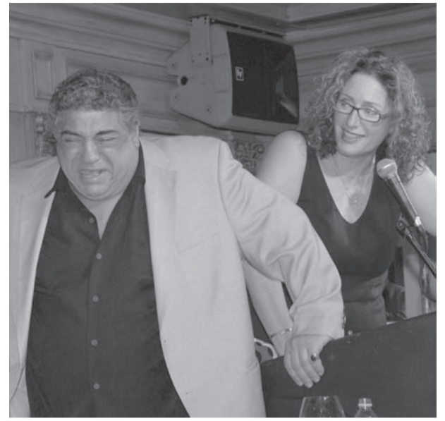
Friars Vincent Pastore, Judy Gold