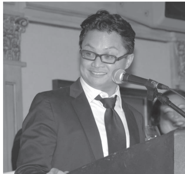
Takei Roastmaster Friar Alec Mapa can't understand why the Friars chose Mr. Sulu to roast