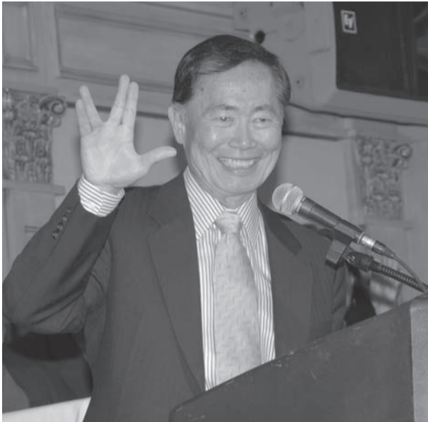
Friar George Takei gets the last laugh